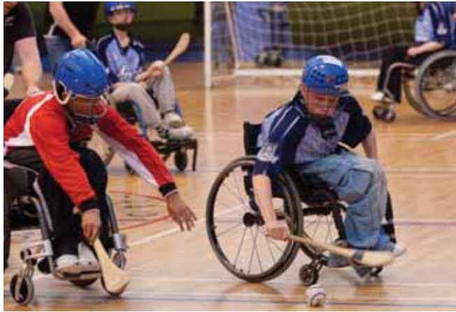
Wheelchair Hurling is a relatively new and exciting competitive sport for manual wheelchair users. This is an action packed and

Limerick Sports Partnership in conjunction with Limerick 'Coaching and Games Promotions Officers' are currently recruiting members to join a WHEELCHAIR HURLING TEAM in Limerick.