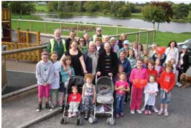
World Heart Day Walk Castleconnell 2010.

Routine exercise will increase your energy level. Exercise will make you feel great and you'll be able to take on more than you ever thought possible. Regular exercise also decreases your chance of developing fatigue and exhaustion. So instead of feeling run down, go for a run.