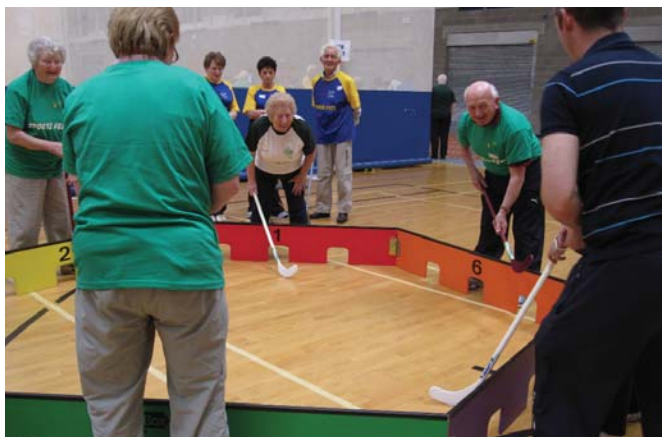
Box Hockey in Action.

County Limerick Local Sports Partnership (LSP) is a sub-committee of Limerick County Development Board and is supported and funded by the Irish Sports Council, to co-ordinate, plan, promote and deliver sport and physical activity opportunities locally.