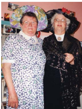
Kilfinane Easter Bonnet.

The Kilfinane club has gotten smaller over the years, but still we enjoy weekly get togethers. The club meets every Wednesday afternoon to play a card game or bingo with tea and cakes all round. Every Thursday the club go to Kilmallock and one Wednesday every month we go to Ballylanders for dinner and bingo.