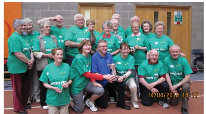
County Limerick Team - Overall Winners 2010.

Activities included golf skills, bocchia, target throw games, speed stacks and box hockey. The Limerick County team were the overall winners of the event.