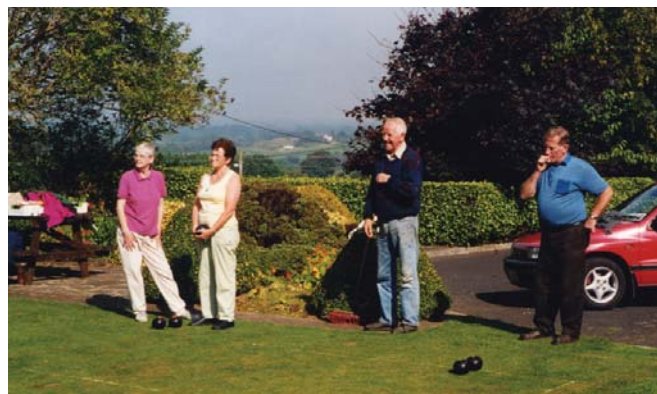
Lawn Bowls . . . Kilfinane.