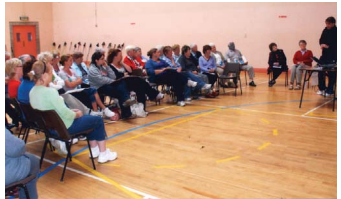
Fit Walk Clinic Foynes: Community Centre, Foynes.