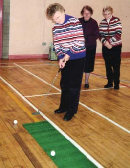
Foynes Putting Challenge!

This is a voluntary group whose main aim is "Care of the Aged and Lonely". The club does visitations, social outings, early spring five day breaks and people in motion nights.