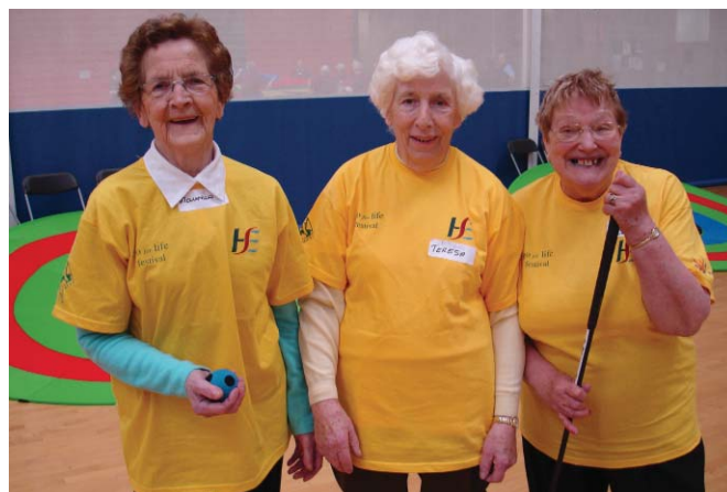
Go for Life Festival.

The Wednesday night get together is enjoyed by all and is a chance to meet old and new friends.