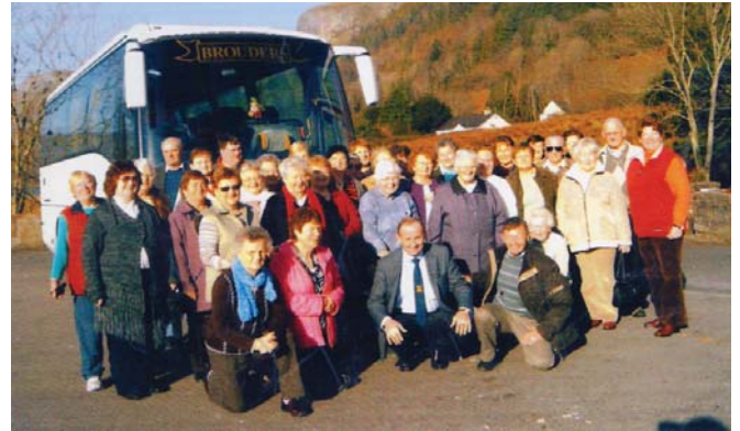
Day Trip for the Foynes Group: Glencar Waterfall 2008.

For anyone who wishes to contact the group please telephone 069-65469.