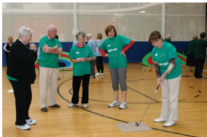
Anyone for Golf . . .