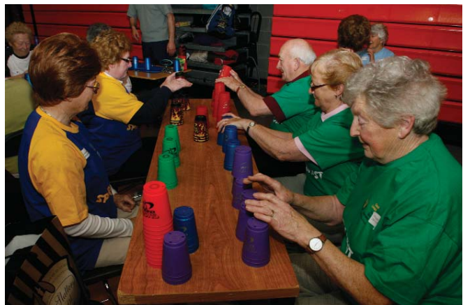
Concentration is the key with Speed Stacks.